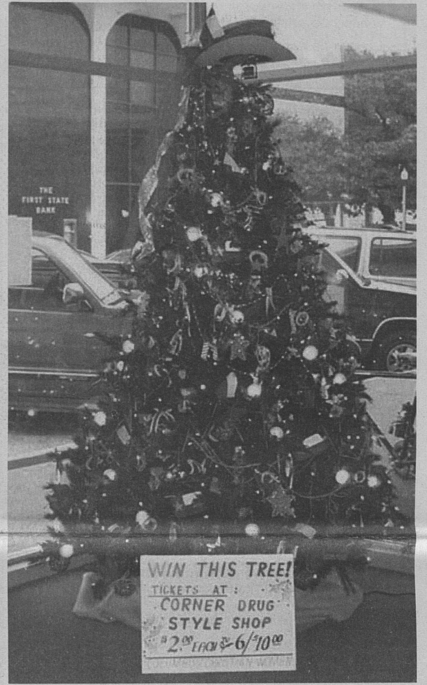
This is the one-of-a-kind seven-foot decorated Christmas tree, "The Texas Lone Star Tree", being given away by the Columbus Christian Women on display at Columbus Health & Fitness Center, 1024 Milan.